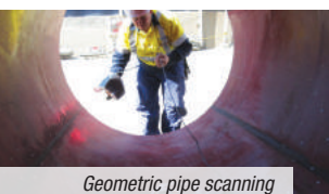
Geometric pipe scanning