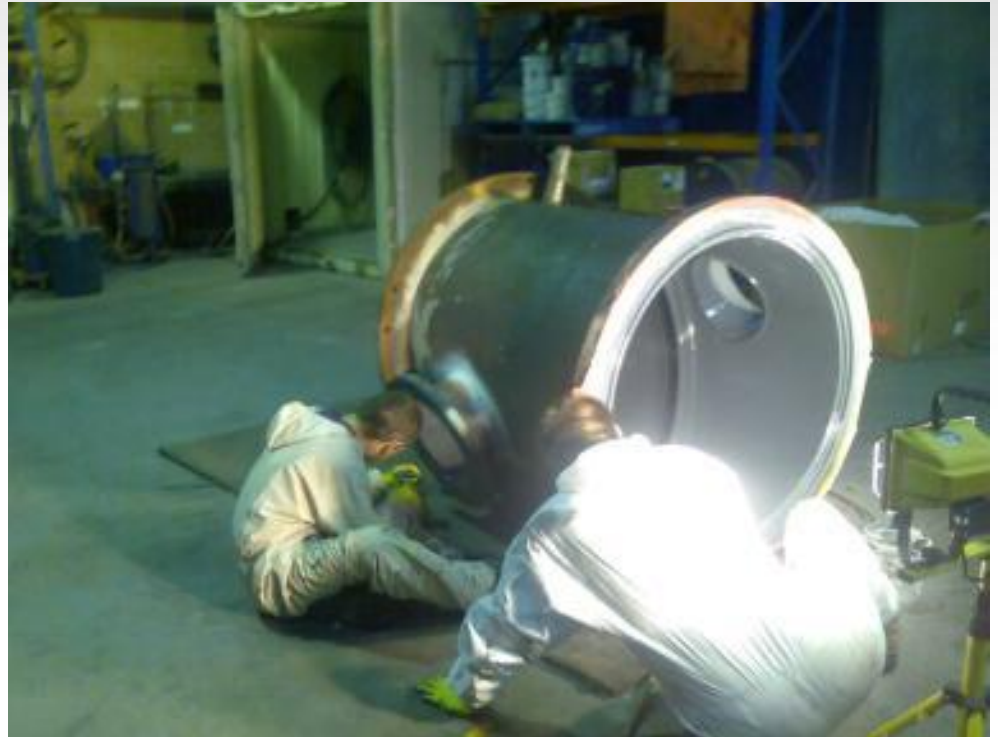
Stripe coating welds

Colour differentiation between coats allows for visual wear inspection.